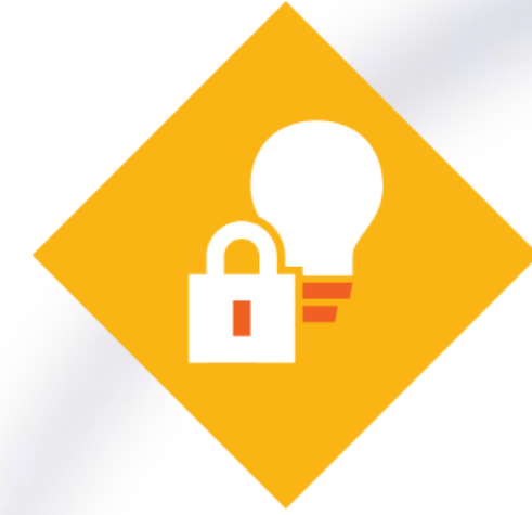
Intellectual Assets Management