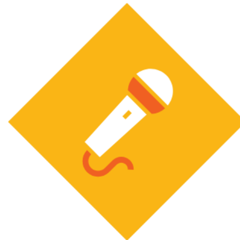
Coaching for Public Speaking